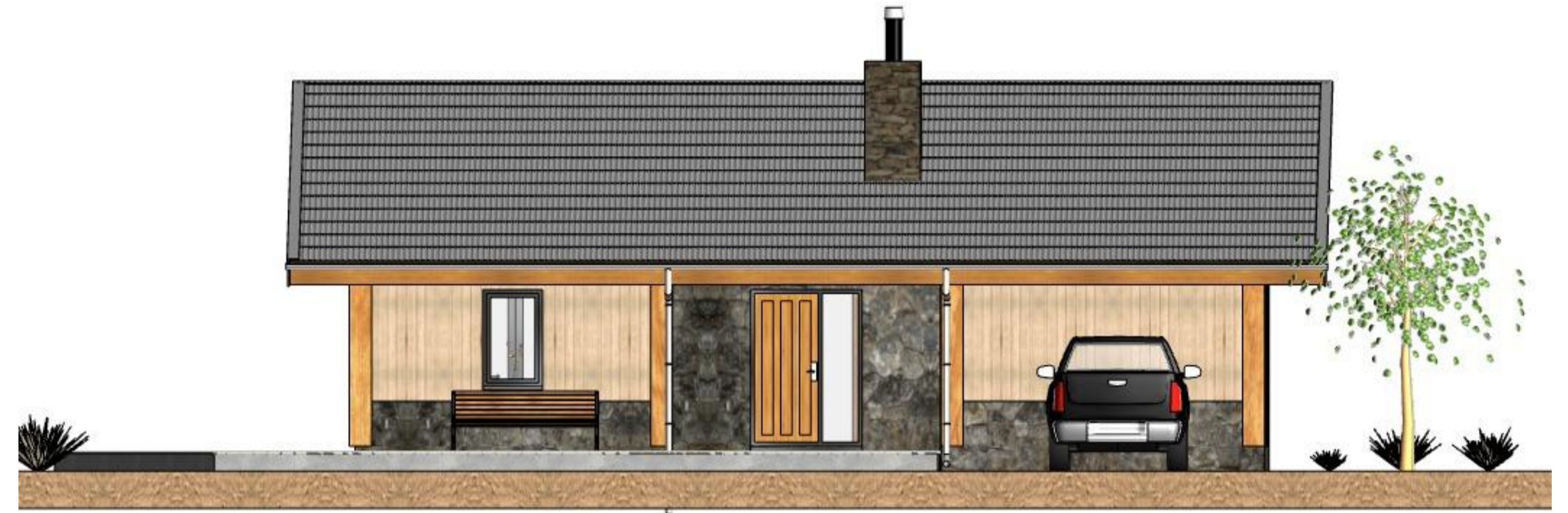
REAR ELEV. 1:500