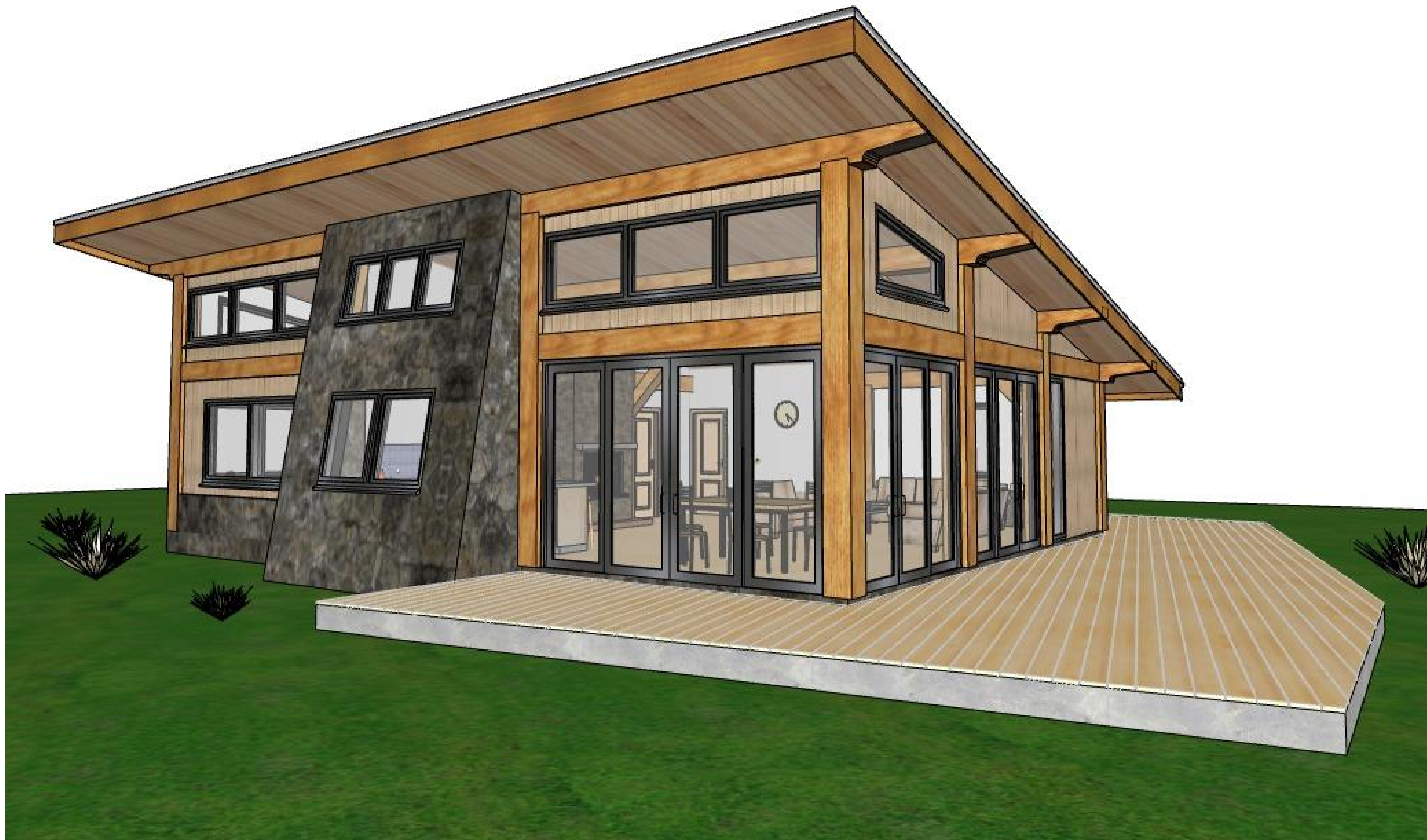
FR PERSPECTIVE 1:255.290