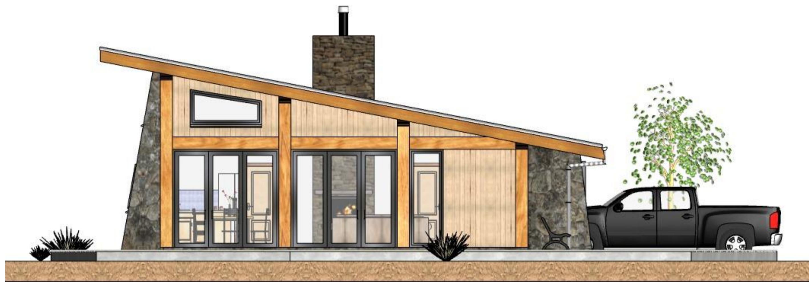
RIGHT ELEV. 1:500