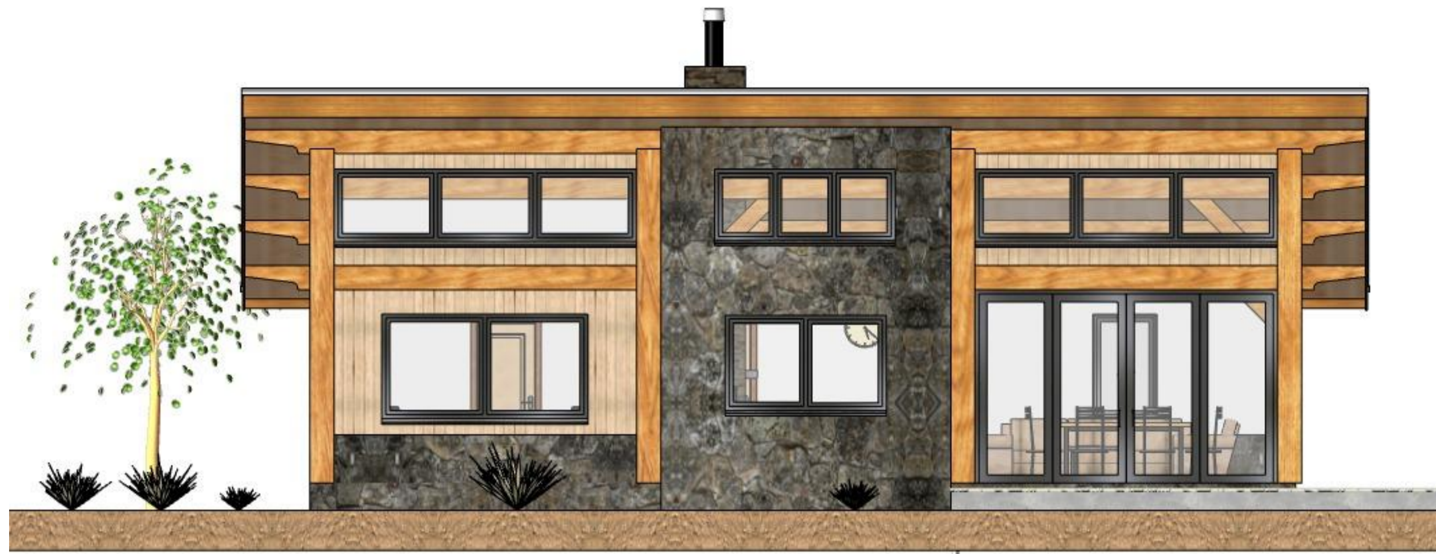
FRONT ELEV. 1:500