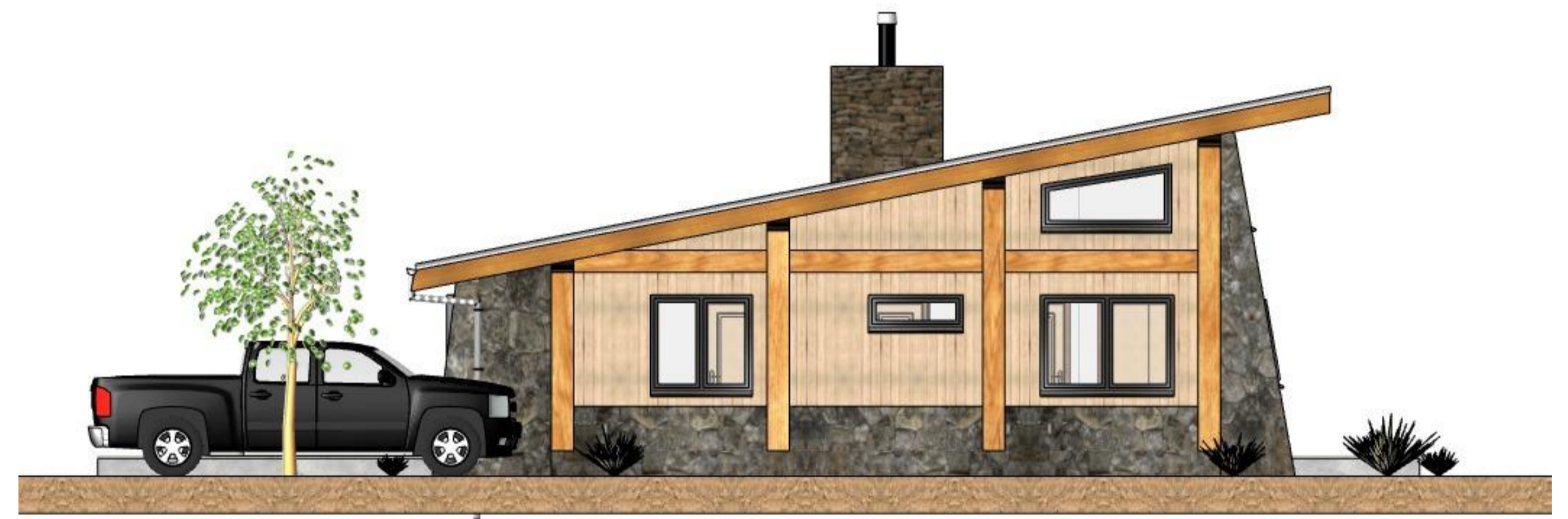
LEFT ELEV. 1:500