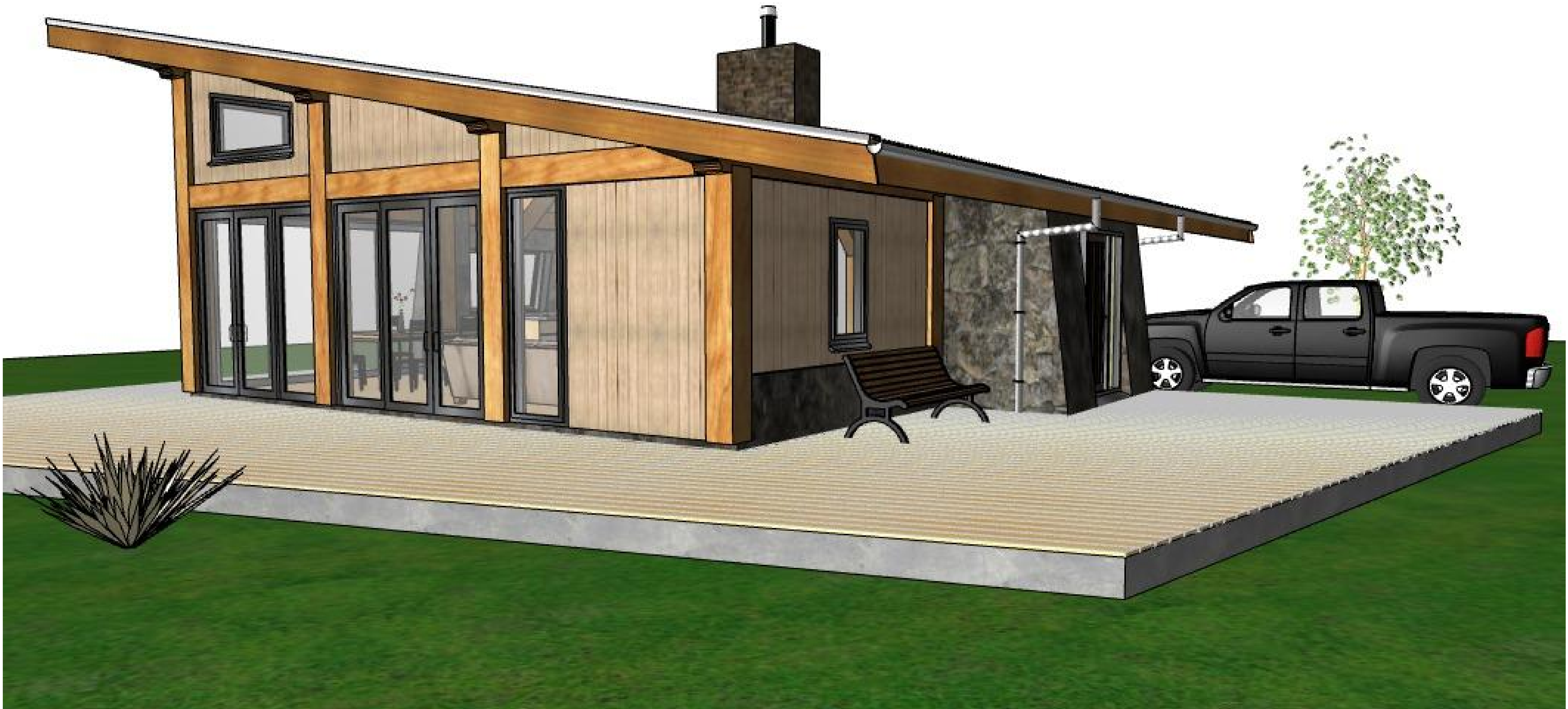
RR PERSPECTIVE 1:229.761